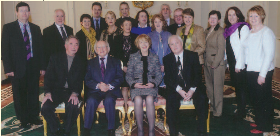
Invitation by President Michael D. Higgins to Áras an Uachtaráin, 2014.